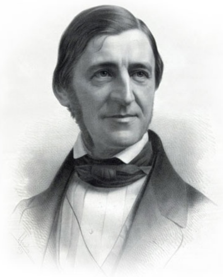
Ralph Waldo Emerson (1803-1882)

genius; for it commonly operates revolutions in our way of life, terminates an epoch of infancy or of youth which was waiting to be closed, breaks up a wonted occupation, or a household, or style of living, and allows the formation of new ones more friendly to the growth of character. It permits or constrains the formation of new acquaintances, and the reception of new influences that prove of the first importance to the next years; and the man or woman who would have remained a sunny garden-flower, with no room for its roots and too much sunshine for its head, by the falling of the walls and the neglect of the gardener, is made the banian of the forest, yielding shade and fruit to wide neighbourhoods of men.