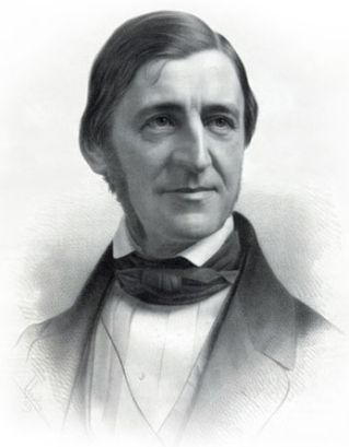
Ralph Waldo Emerson (1803-1882)