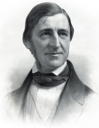
Ralph Waldo Emerson (1803-1882)

It has seemed to me lately more possible than I knew, to carry a friendship greatly, on one side, without due correspondence on the other. Why should I cumber myself with regrets that the receiver is not capacious? It never troubles the sun that some of his rays fall wide and vain into ungrateful space, and only a small part on the reflecting planet. Let your greatness educate the crude and cold companion. If he is unequal, he will presently pass away; but thou art enlarged by thy own shining, and, no longer a mate for frogs and worms, dost soar and burn with the gods of the empyrean. It is thought a disgrace to love unrequited. But the great will see that true love cannot be unrequited. True love transcends the unworthy object, and dwells and broods on the eternal, and when the poor interposed mask crumbles, it is not sad, but feels rid of so much earth, and feels its independency the surer. Yet these things may hardly be said without a sort of treachery to the relation. The essence of friendship is entireness, a total magnanimity and trust. It must not surmise or provide for infirmity. It treats its object as a god, that it may deify both.