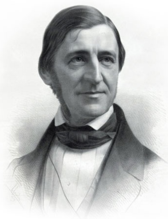
Ralph Waldo Emerson (1803-1882)

So use all that is called Fortune. Most men gamble with her, and gain all, and lose all, as her wheel rolls. But do thou leave as unlawful these winnings, and deal with Cause and Effect, the chancellors of God. In the Will work and acquire, and thou hast chained the wheel of Chance, and shalt sit hereafter out of fear from her rotations. A political victory, a rise of rents, the recovery of your sick, or the return of your absent friend, or some other favorable event, raises your spirits, and you think good days are preparing for you. Do not believe it. Nothing can bring you peace but yourself. Nothing can bring you peace but the triumph of principles.